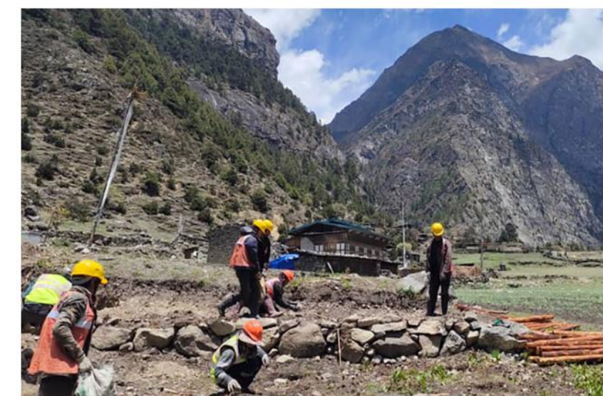
June 12, 2024 Shangsa village in Lunana is set to benefit from clean and reliable energy by August this year. The work is underway to install a solar system for the 10 households of the village.