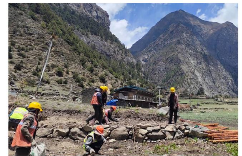
June 12, 2024 Shangsa village in Lunana is set to benefit from clean and reliable energy by August this year. [The work is underway to install a solar system for the 10 households of the village.