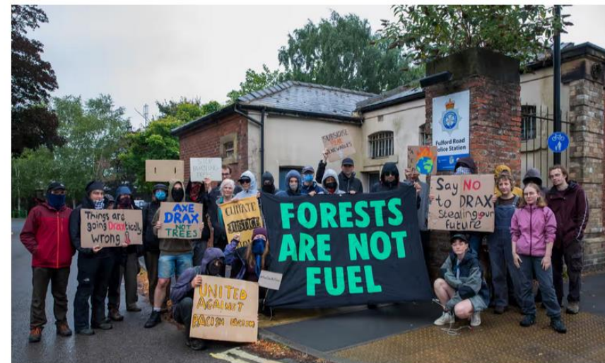
Anti-Drax protesters gathered outside Fulford police station in York to await the release of people who had been arrested.