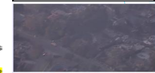
Aerials show scale of damage and areas in Altadena still smoldering from devastating fires Thousands of people remained displaced on Saturday following the devastating Los Angeles fires, but some were being allowed to return to their homes as firefighters contained their efforts to contain the fires.

"Free Tribune: Stop burning wood Sun Jan 19, 13:22 Boston by Jan Juffermans