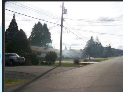
Bill Lewin x British Columbia Wood Smoke December 22, 2024

And the burning just goes on and on and on. Children are exposed every day to air pollution in our valley from debris prescribed burns, wood stoves, fire pits and wild fires. People are dying from this pollution and nobody seems to care.