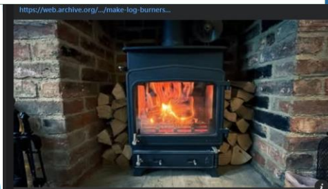
Let's stop this log burner madness please My neighbours lighting their fires every night is worse for me than the busy main road nearby

And the burning just goes on and on and on. Children are exposed every day to air pollution in our valley from debris prescribed burns, wood stoves, fire pits and wild fires. People are dying from this pollution and nobody seems to care.