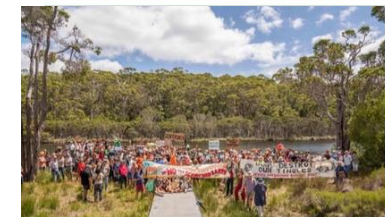
Hundreds of concerned citizens gathered in Norralup to protest this season's widespread prescribed burning operations.