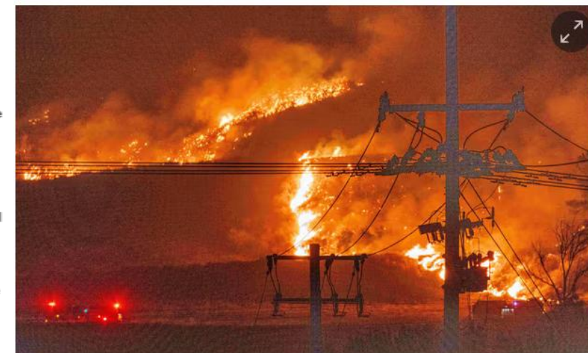
Wildfire in Castaic Lake area, California, on 22 January this year.