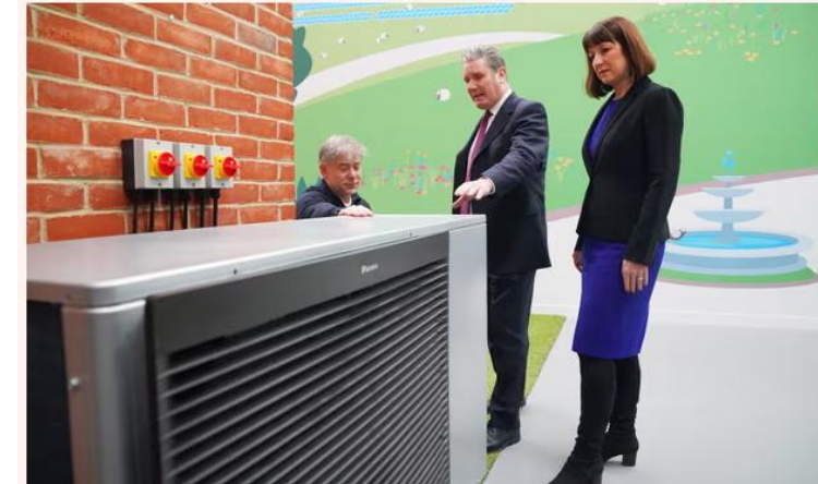
Keir Starmer and Rachel Reeves being shown a heat pump demonstrator during a visit to Octopus Energy in Berkshire last year

Fact that chancellor swerved climate crisis and net zero targets suggests sector has avoided the axe for now