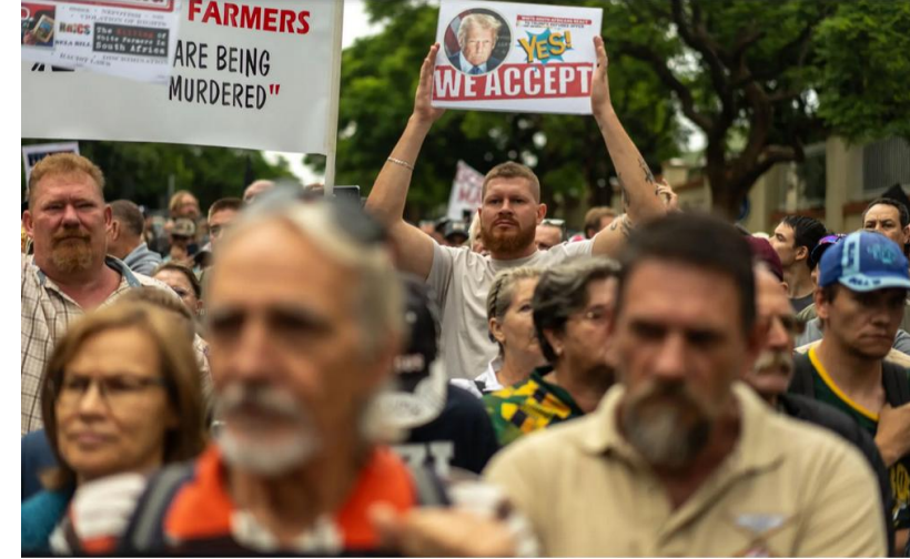
White South Africans rallying in February outside the U.S. embassy in Pretoria, South Africa.