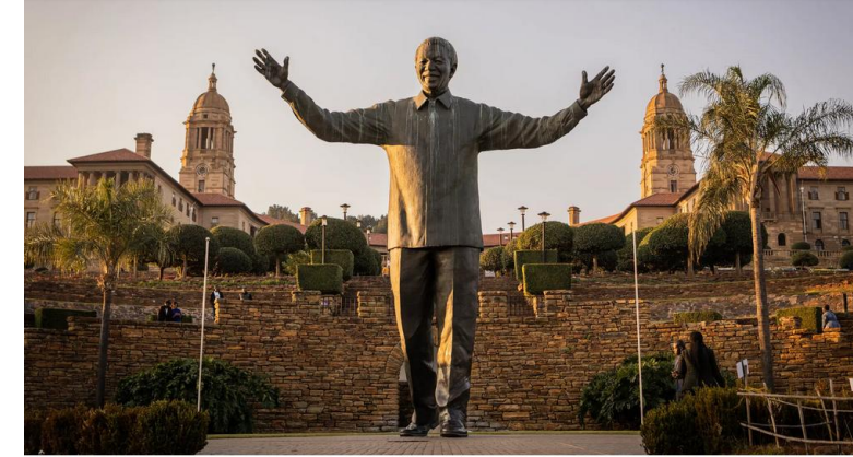
A statue of Nelson Mandela outside the Union Buildings, the seat of the South African government, in