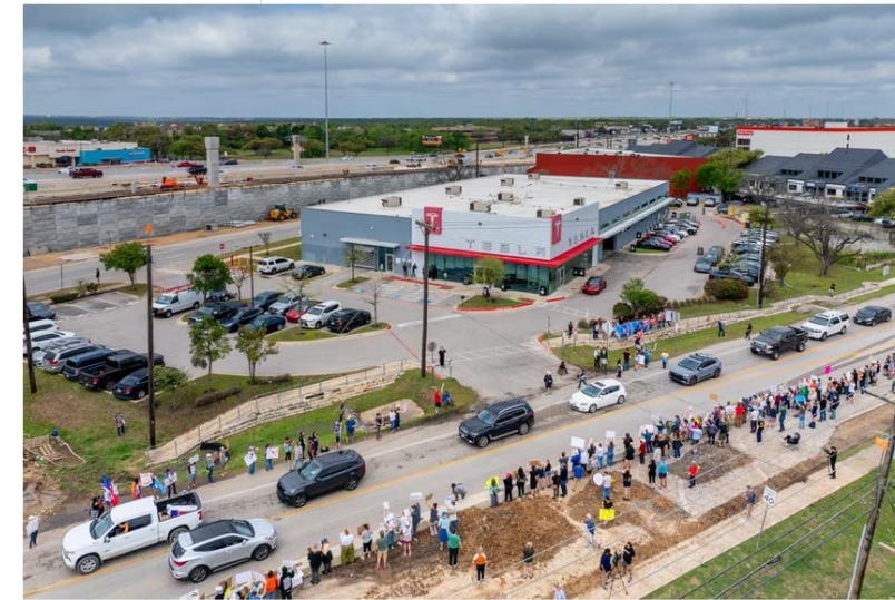
A protest at a Tesla dealership in Austin, Texas, on 29 March 2025.

In San Francisco, a crowd of around 200 people gathered in front of the Tesla showroom. Protesters spilled into the busy street and onto the median, confusing the self-driving Waymos trying to get around people darting back and forth.