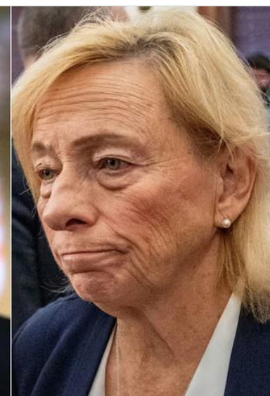
Donald Trump and Maine governor Janet Mills