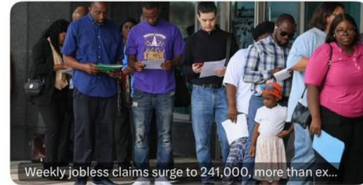
Weekly jobless claims surge to 241,000, more than ex...

Weekly jobless claims surge to 241,000, more than expected, in latest sign of economic trouble