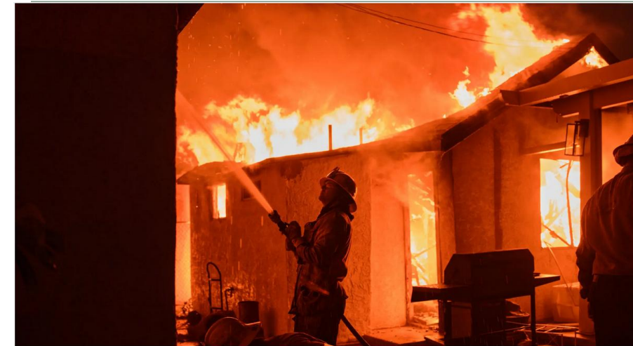
Analysts say California's population could well decline because of the wildfires that wiped out more than 6,000 homes in Los Angeles in January.