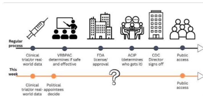
Regular vaccine process vs. this week. Figure by Your Local Epidemiologist