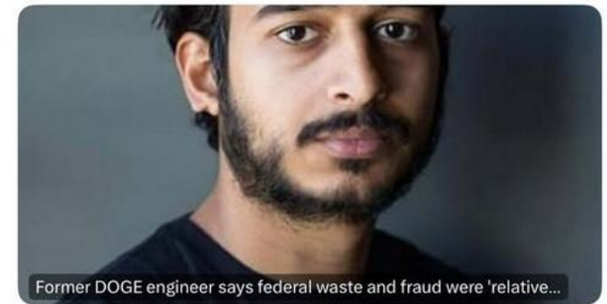
Former DOGE engineer says federal waste and fraud were 'relative...

Former DOGE engineer says federal waste and fraud were 'relatively nonexistent' - NPR